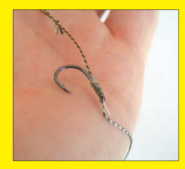
10. Make sure that the line comes out of the tube on the side of the hook point and that the hair leaves the tube opposite of the hook point