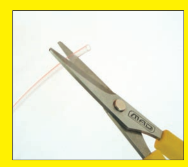
6. Cut a small piece of shrink tube