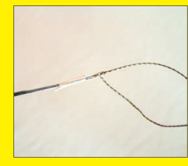
8. Pull the end of the rig link through the tiny hole and pull the hook towards the tube