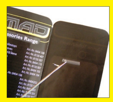
7. The most vital step for this rig; make a tiny hole in the tube with your needle just before the end