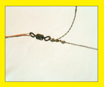
11. Now tie the swivel to the hook link with a knot that you trust most