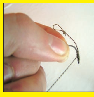
4. Connect the Razor hook to the braid with a knotless knot