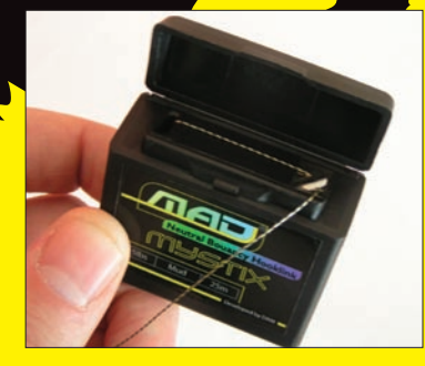
2. Cut a piece of Mystix rig link in the length of your own preference