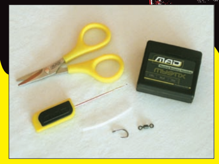
MAD Mystix, Razor Hook and shrink tube are the main components needed for this rig