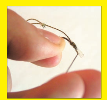
9. Pull the eye of the hook into the shrink tube