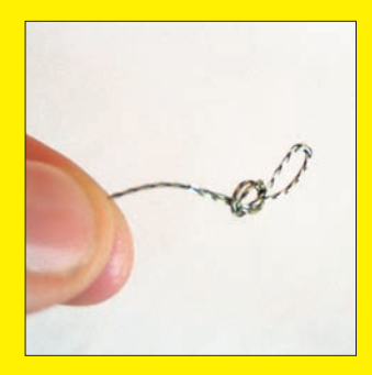
3. Tie a little loop on one end of the braid