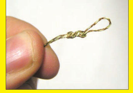
10. Tie a loop knot on the end of the rig to connect to either a quick<sup>®</sup> change or a normal swivel