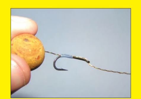
Now pull the boilies towards the hook bend until the hair has the ideal length