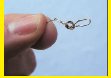
3. Tie a little loop on one end of the braid