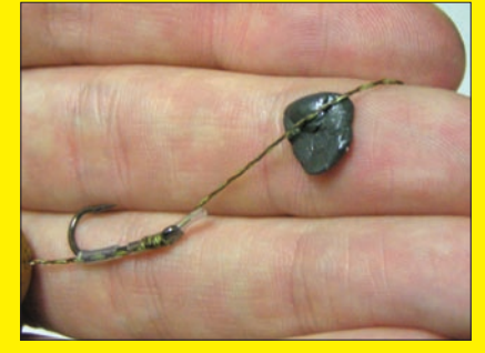
11. To keep the rig line neatly pinned to the bottom, put a piece of tungsten putty on the braid