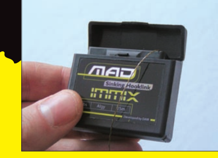
2. Cut a piece of Mystix rig link in the length of your own preference

1. MAD<sup>®</sup> Mystix, Longshank Hook, and shrink tube are essential for this tactical rig