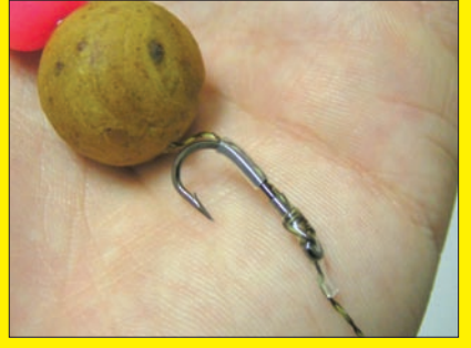
9. Check if the hooking effect of the rig is optimal by sliding off your hand

8. Slide a piece of shrink tube over the line and the eye of the hook (if you like, you can add a line aligner effect like shown here)