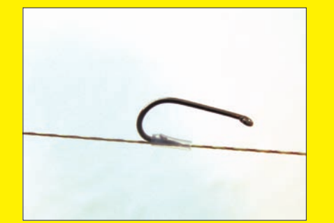
6. Slide the piece of rig tube on the shank of the hook