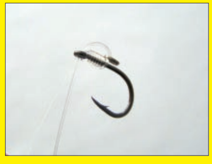
5. Put the end of the hair back through the eye of the hook so that it forms a nice D-shape on the hook shank