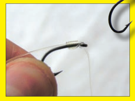
3. Make a knotless knot and make sure that the rig end is going through the eye of the hook on the side of the point