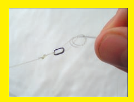
10. Now tie the short rig part to a piece of Ambush of around 10 cm long by using a loop knot