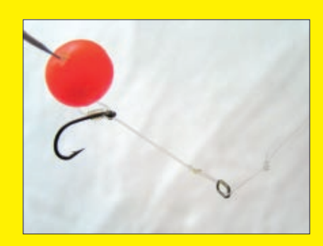
11. Finish the rig by tying a swivel onto the end of the rig to connect it with the mainline and by putting a piece of tungsten putty next to the oval rig ring