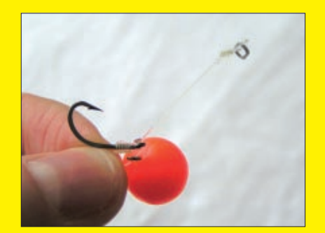
9. The part standing up from the bottom looks like this