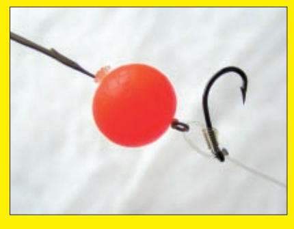
8. Tie a pop-up onto the round rig ring on the D-shaped hair and notice how the hookbait can move freely up and down the hook shank