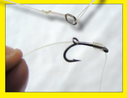
4. Then slide a rig ring over the hair