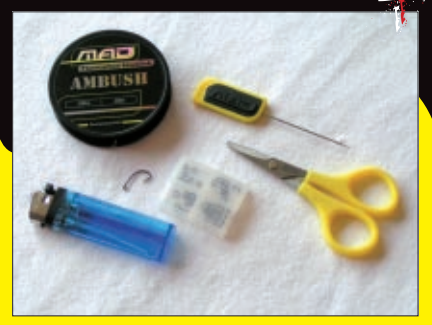
1. This is what we need to make this rig