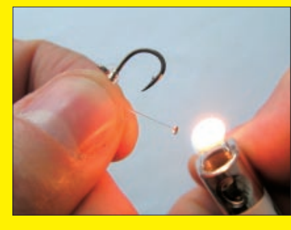
6. With a lighter you make a blob on the end of the hair part so that it cannot go back through the hook's eye